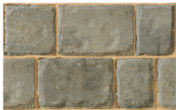
Silver Haze (SH)

Add AG/SH/RB to the product code to specify the colour. For example the code for a Regatta TRIO 60mm in Silver Haze (SH) from our South East factory at Cliffe would be RGTC60SH.