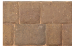
Rustic Bronze (RB)