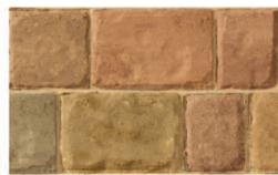
Autumn Gold (AG)